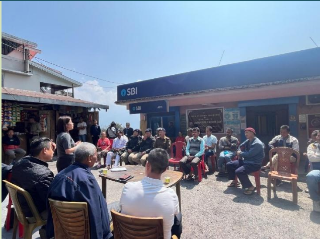
Phodong Bazaar, Mangan district