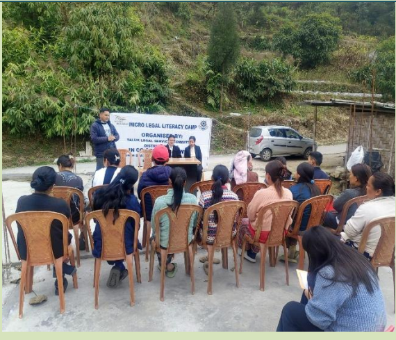
Dewanitar, Soreng district