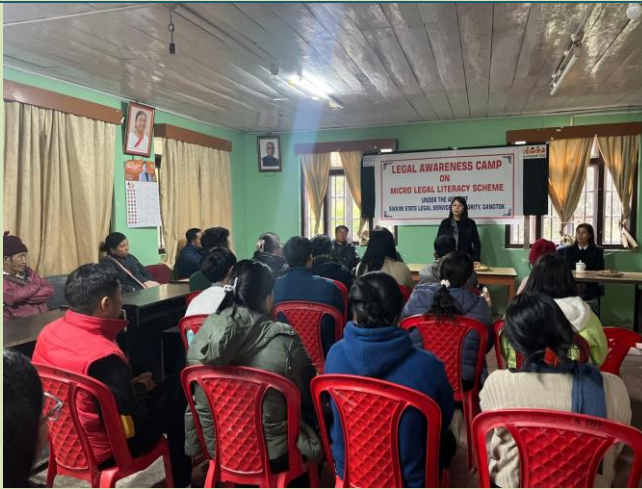
Chawang, Men Rongong GPU, Mangan district