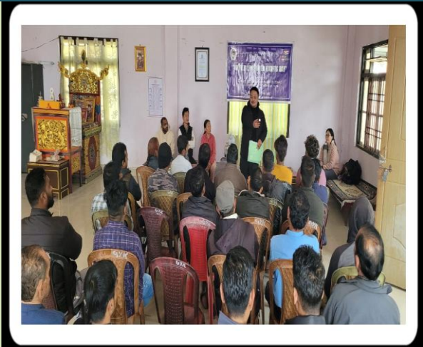
Gyonten Yargay Hall, Chandmari, Gangtok district