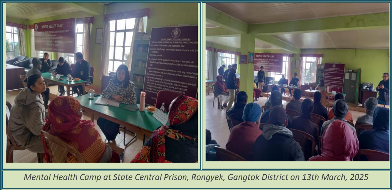
Mental Health Camp at State Central Prison, Rongyek, Gangtok District on 13th March, 2025