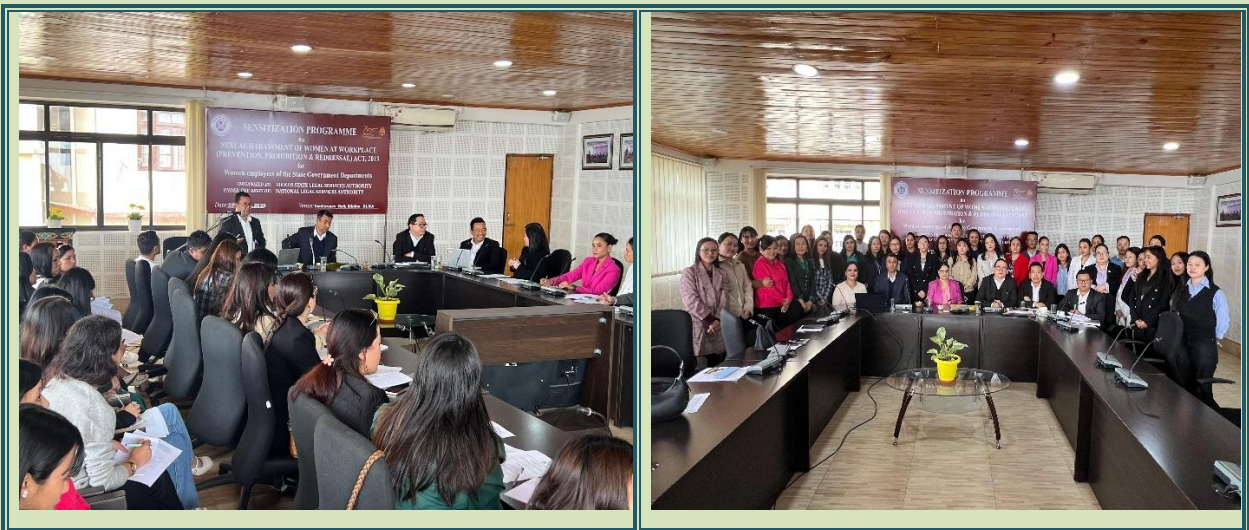
Sensitization Programme on Sexual Harassment of Women at Workplace (Prevention, Prohibition & Redressal) Act, 2013 for female employees and Members of Internal Complaints Committee of Labour Department, Government of Sikkim on 29th March, 2025 at the Conference Hall of Sikkim SLSA, Development Area, Gangtok

The welcome address was delivered by the Member Secretary, Sikkim SLSA while the vote of thanks was proposed by the Deputy Secretary, Sikkim SLSA.