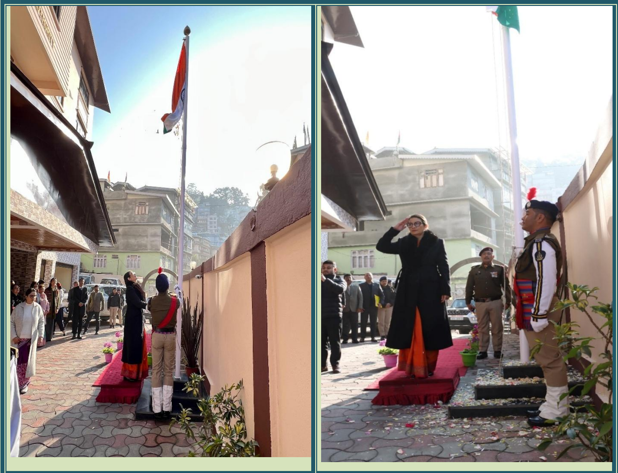
Celebration of 76th Republic Day on 26th January, 2025 in the office premises of Sikkim SLSA, at Development Area, Gangtok

The programme was attended by Judicial Officers, Senior Advocates, Panel Advocates, Officers and staff members of the Sikkim SLSA.