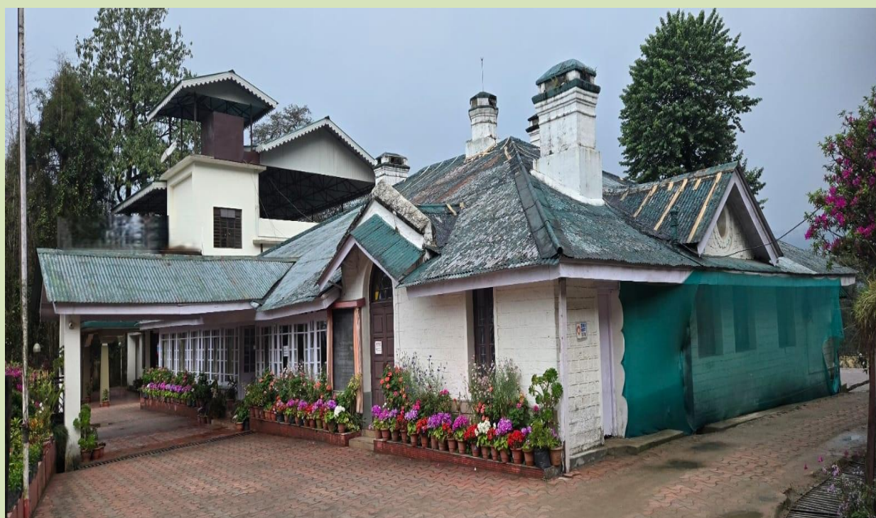
Former office building of Sikkim State Legal Services Authority, Forest Colony, Gangtok