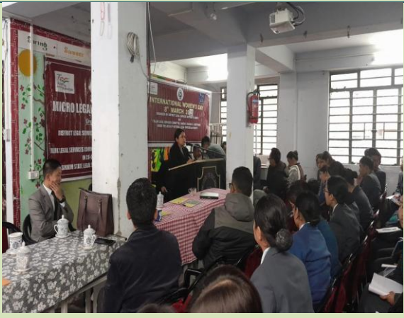
District Institute of Education and Training (DIET), Namchi district