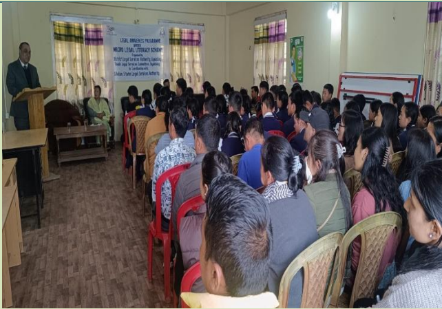
Sardong GPU, Gyalshing district